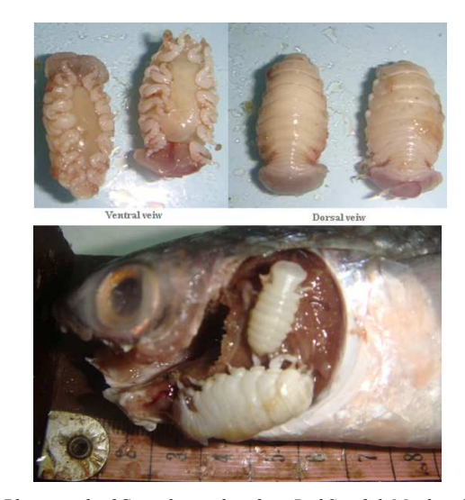
Fig 1. Photograph of Cymothoa indica from Red Sea fish Moolgarda seheli, Yemen.

Length 9.5-12 (10.5) mm, width 3-5 (4.0) mm; small, parallel-sided, eyes dark.